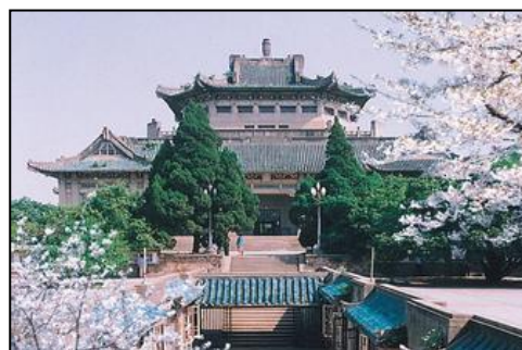
Fig. 2b. Wuhan University