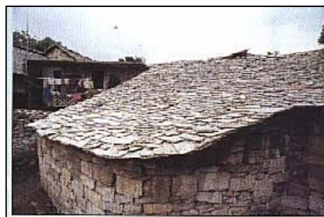
Fig. 1d. Stone Masonry Houses