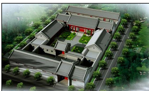
Fig. 3. Quadrangle Courtyard in North China

Facing south not only gives access to light but also provide shelter from the wind. Chinese climate belongs to the monsoon type and includes cool and warm winds. Feng Shui principles of orientation are to choose sites facing toward the east and south which can accept the pleasant and warm wind called Yang Feng . However, a site facing to the north and west suffers a cool or chilly wind called Yin Feng . Without a wind block nearby, the family may experience decay due to bad weather. So conforming to the heavens, acquiring the mountains' spirit and taking sun baths are the best way to keep healthy and edify sentiment. For example, the traditional quadrangle courtyard in north China is the typical building which has experienced three thousands of years of use (Fig. 3).