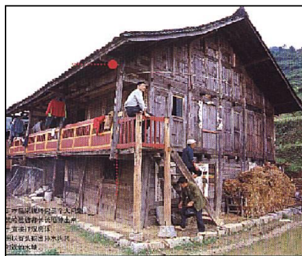
Fig.1b. Bamboo Buildings in Southwest China