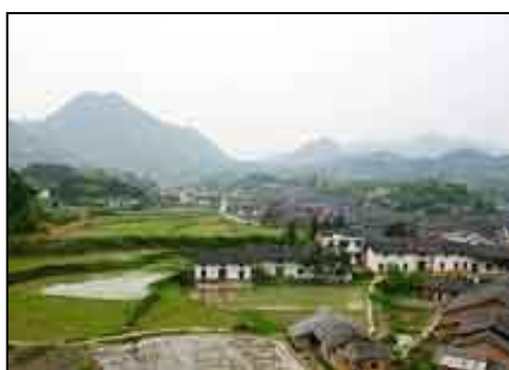
Fig. 2a. Zhang Guying Scenery: Village in Hunan Province

Another form is where the hills are covered by large groups of houses. For example, Wuhan University (Fig. 2b) is situated in the LuoJia Mountains and built against the mountainside. The student dormitories are close to the hillside, ringed with curved walls with a gate-shaped entrance. The mountain platform takes the city gate entrance as its axis. The libraries and teaching buildings are situated on both sides respectively, which is in hierarchical order and strict symmetry.