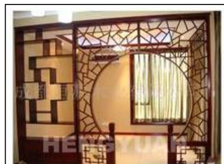
Fig. 4. Screen Used for Indoor Design